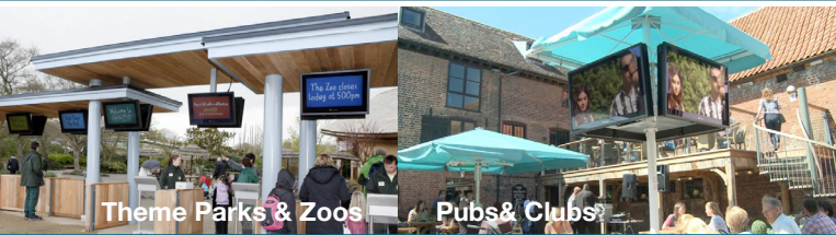
Theme Parks & Zoos